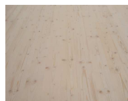
VI Visible quality