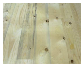
NVI Non-Visible quality